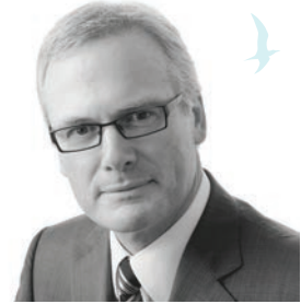
Hon Steve Maharey Massey University